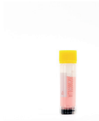
1.8ml Screw cap