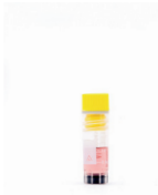
1.2ml Screw cap