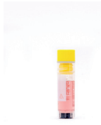
2ml Screw cap